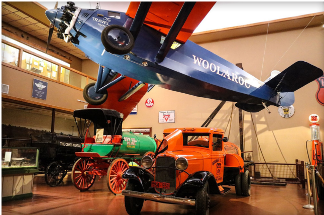
Woolaroc Museum & Wildlife Preserve Bartlesville, OK

In appreciation for our great state, we put together a list of six historical and archaeologically relevant places you can visit within the Sooner State. These sites can be great budget-friendly daytrips or retirement adventures inspiring us to take in the world that closely surrounds us. While they may not always be the most glamorous, they speak to the enduring spirit of the people who created and maintain the sites.