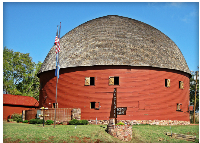
The Old Round Barn Arcadia, OK

Built in the 1850s, the Edwards Store is known as the last original surviving structure on the 192-mile Butterfield Overland stage line. It carried passengers and the U.S. mail between St. Louis and San Francisco and remains an emblem of railroad expansion.