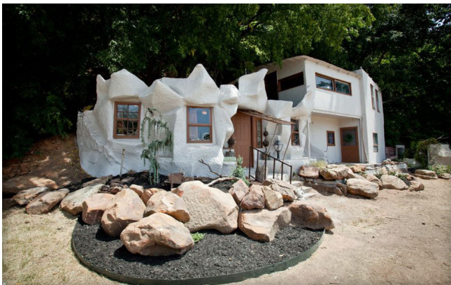
The Cave House Tulsa, OK

The Woolaroc Museum presents one of the world's most unique collections of art. Whether it is Native American pottery or collections of Colt firearms, this 3,700 acre wildlife preserve is also home to more than 30 varieties of native and exotic animals and birds.